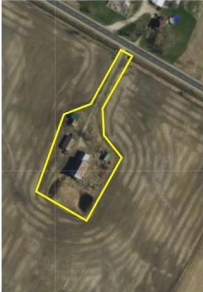
Irregular Lot - approximately 1.0 ha