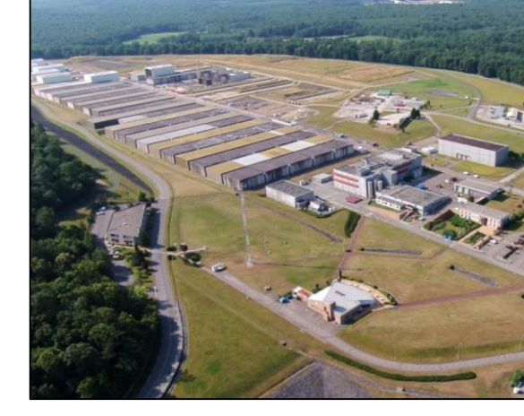
Near-surface facility: Centre de l'aube, France