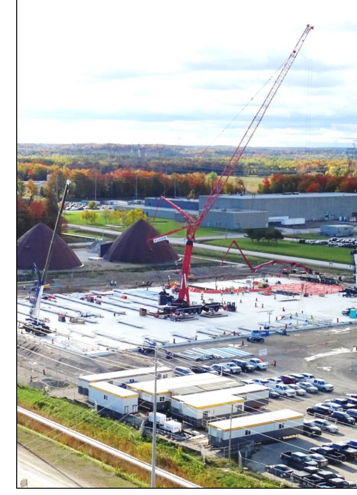
Storage Buildings 5 & 6 - cranes on site to raise steel.