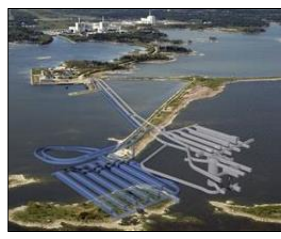
DGR: SKB Forsmark repository in Sweden