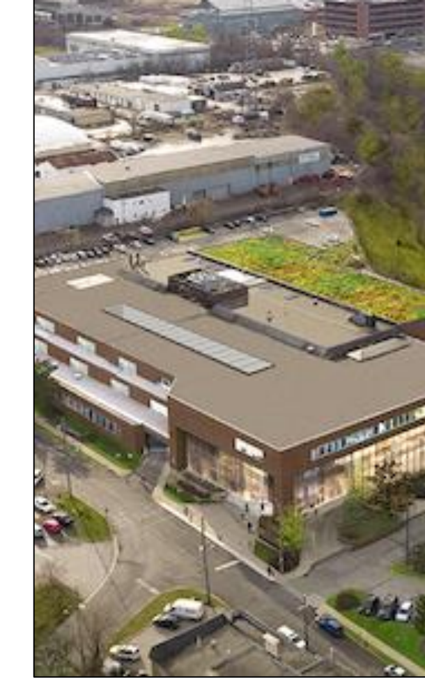
Laurentis-McMaster facility in Hamilton.