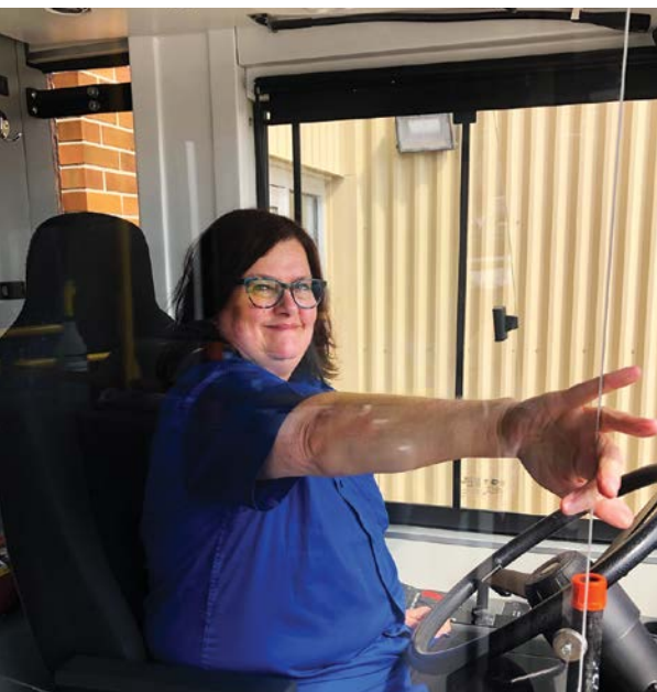
To keep drivers and riders safe, the City of Selkirk, MB, installed Plexiglas shields and closed off alternating rows inside the buses to encourage physical distancing.