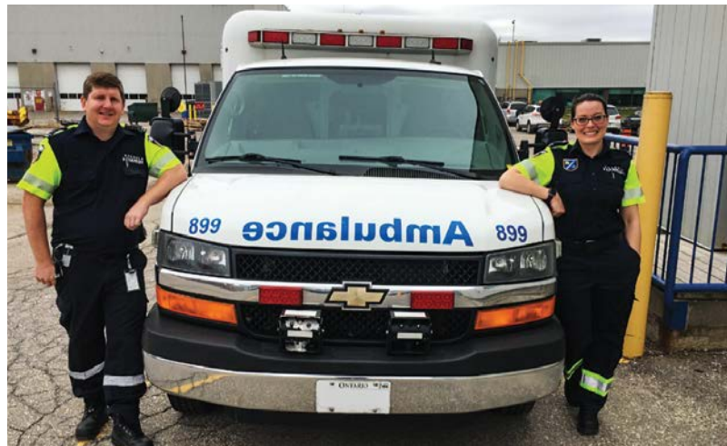
Paramedics are on the frontlines providing life-saving services including emergency and non-emergency pre-hospital care to residents.

When the time comes, municipalities will also be ready to lead Canada's recovery, along with our federal partners. Local leaders are already delivering frontline results for Canadians. And they are exceptionally well-placed to deliver stimulus funding quickly—to create jobs and get the economy going. Deepening the federal-municipal partnership even further will help Canada thrive and prosper once again.