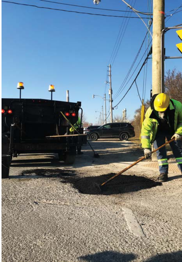
Municipal road maintenance staff are working around the clock to keep roads safe and accessible for those delivering essential services.