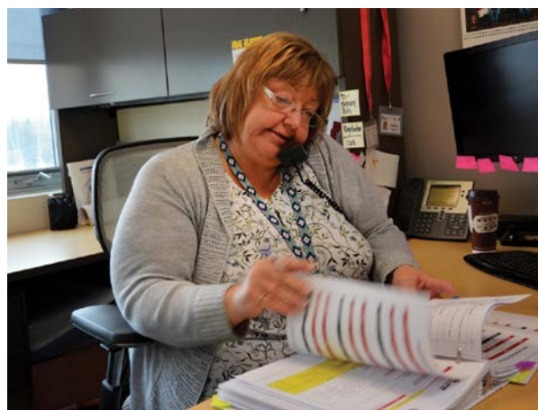
The Vulnerable Person's Registry is a critical program where the elderly and people with special needs are contacted daily, making sure that they are safe and their needs are being met.