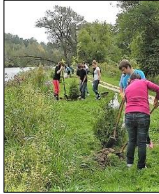
SVCA Tree Planting