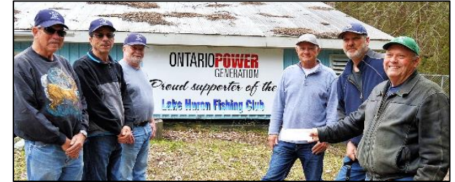
Two local fish hatcheries