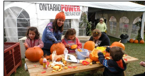
Port Elgin Pumpkinfest