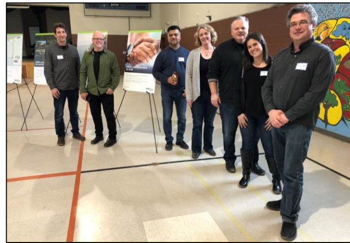
OPG staff at SON Community Engagement Session