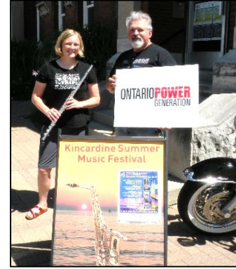
Kincardine Music Festival