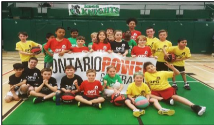
OPG Basketball League