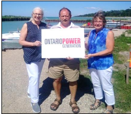
Point Clark Boat Club Restoration