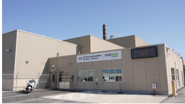
5 - OPG's Nuclear Sustainability Services Building in Bruce County