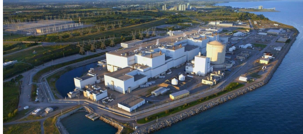
6 - Darlington Nuclear Power Generating Station