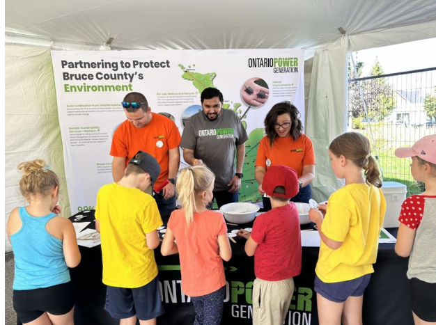
7 - OPG booth at the 2023 Pumpkinfest