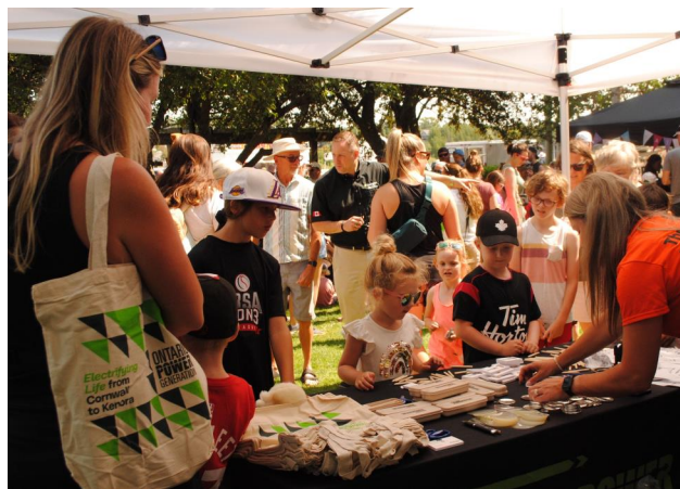
1 - Photo Credit: Sandra Howe