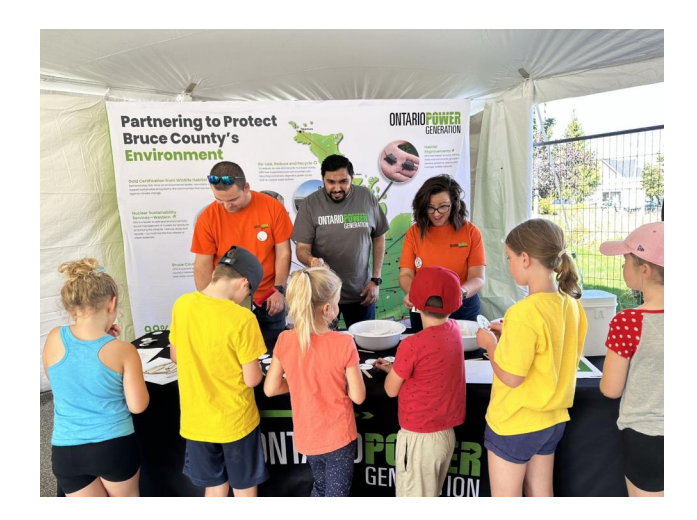
7 - OPG booth at the 2023 Pumpkinfest