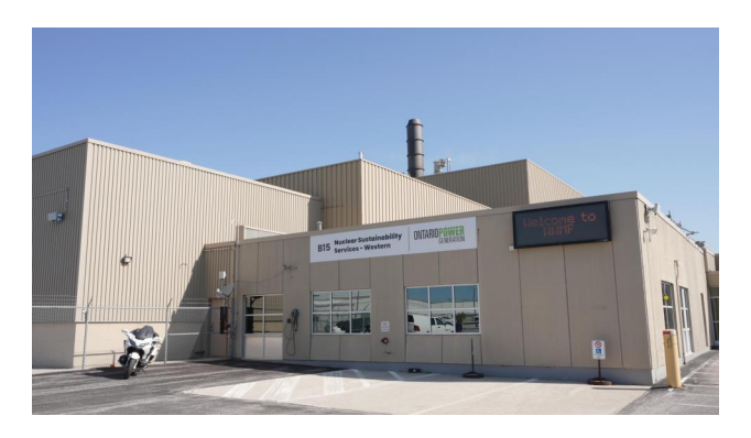
5 - OPG's Nuclear Sustainability Services Building in Bruce County