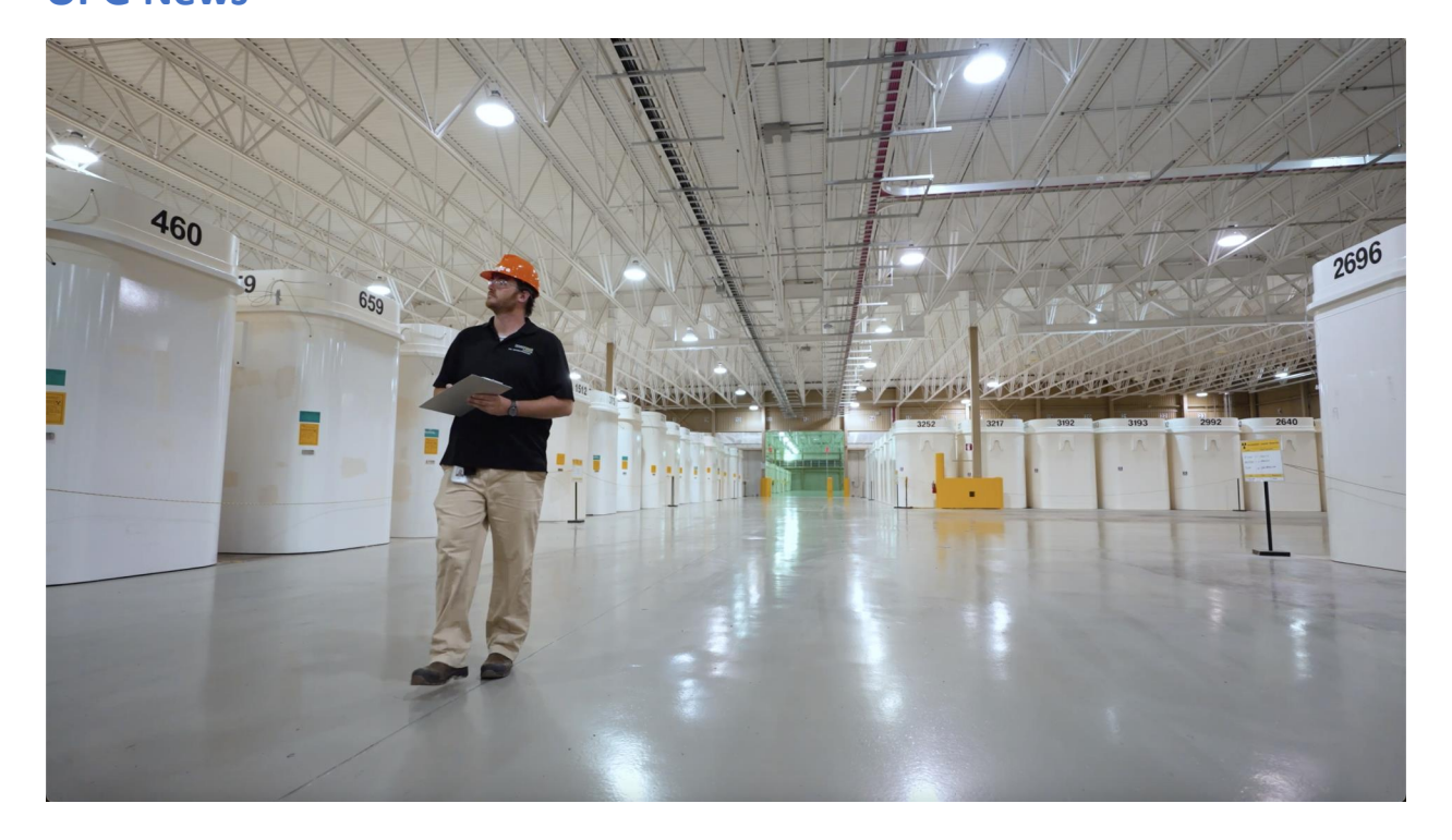
OPG releases first Integrated ESG Annual Report