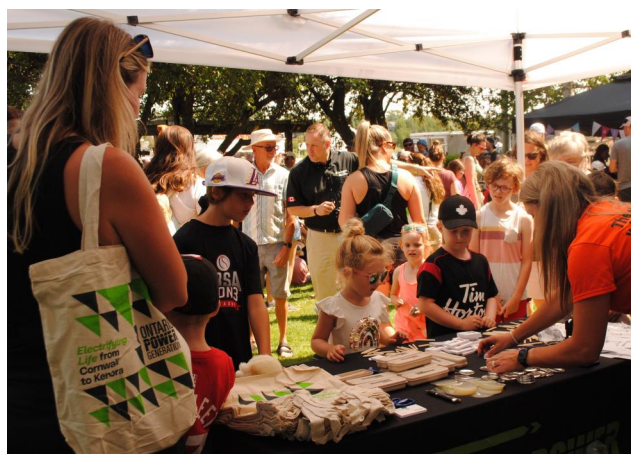
1 - Photo Credit: Sandra Howe