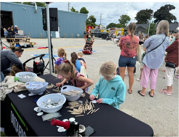
Marine Heritage Festival

Southampton's 13th annual Marine Heritage Festival was held from July 26-28, with OPG's Fun in the Park portion of the event held on the Saturday in Pioneer Park. OPG staff joined local vendors, businesses and hundreds of event attendees for the fun, family-friendly activities. The event was an all-around success and the weather was perfect! Check out some photos below.