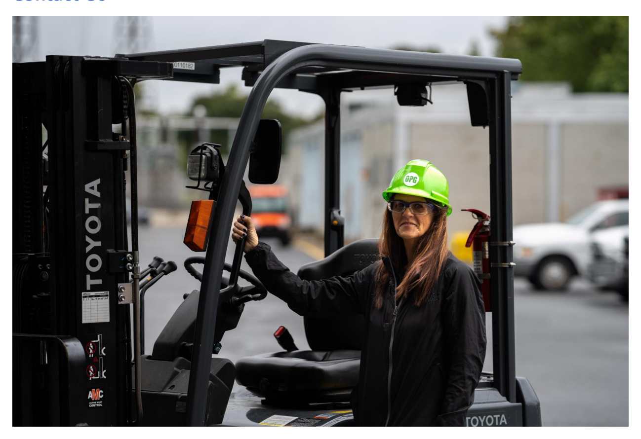
Ontario Power Generation

Nuclear Sustainability Services - Western Waste Management Facility