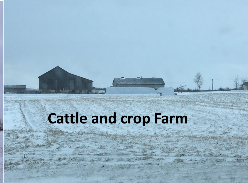
Cattle and crop Farm