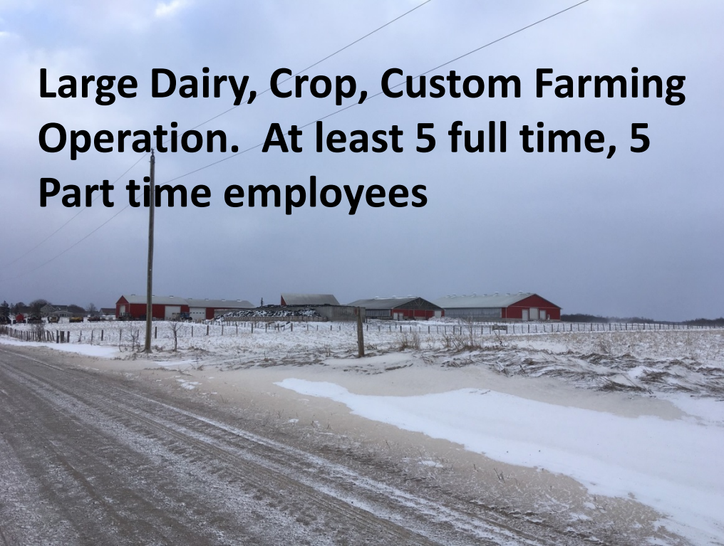
Large Dairy, Crop, Custom Farming Operation. At least 5 full time, 5 Part time employees