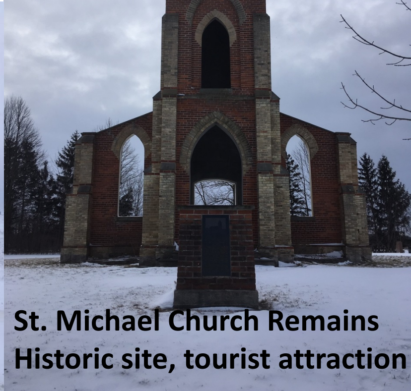
St. Michael Church Remains Historic site, tourist attraction