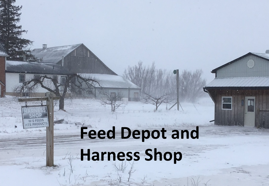
Feed Depot and Harness Shop