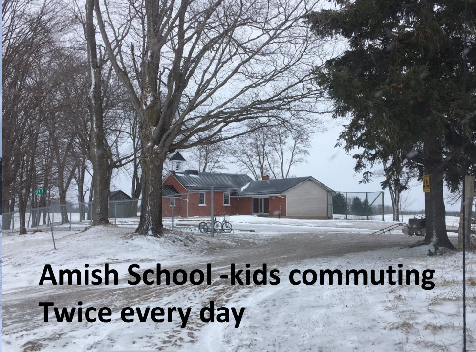
Amish School -kids commuting Twice every day