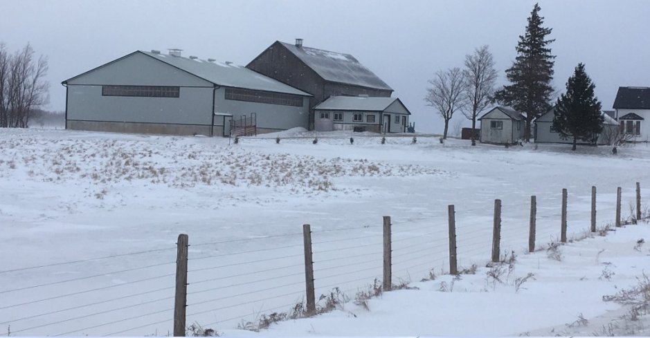
Cattle and Crop Farm