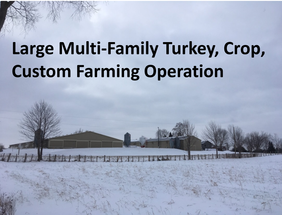
Large Multi-Family Turkey, Crop, Custom Farming Operation