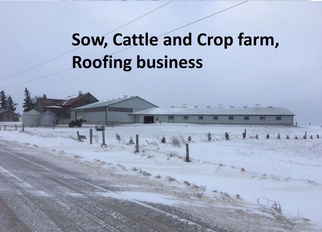
Sow, Cattle and Crop farm, Roofing business