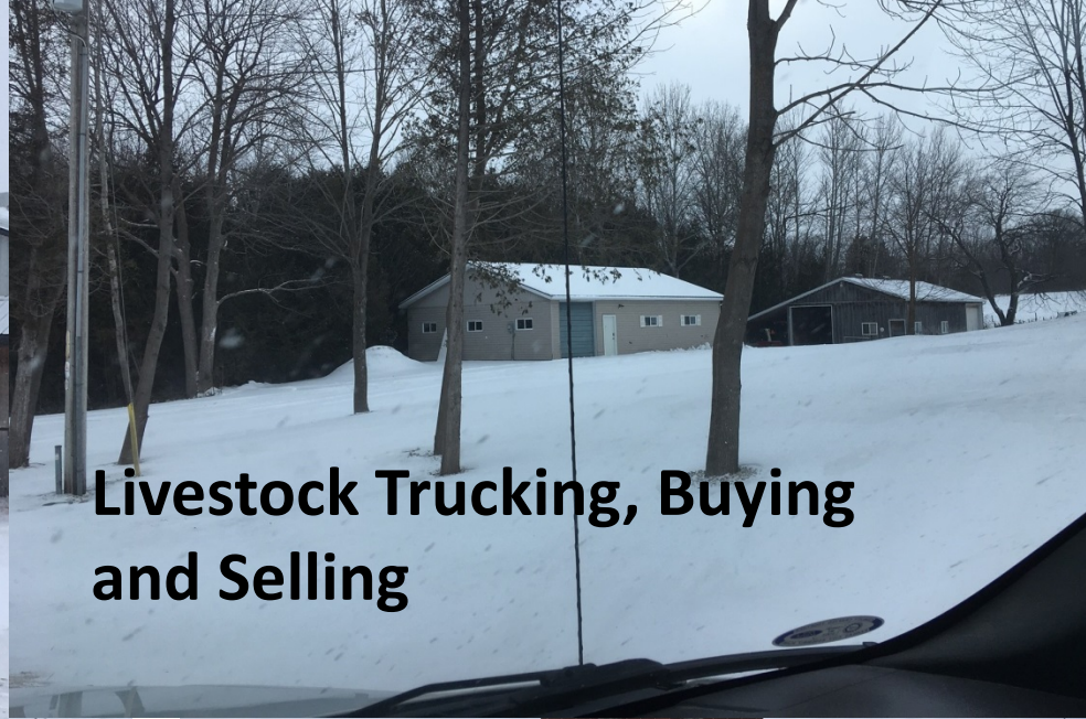
Livestock Trucking, Buying and Selling