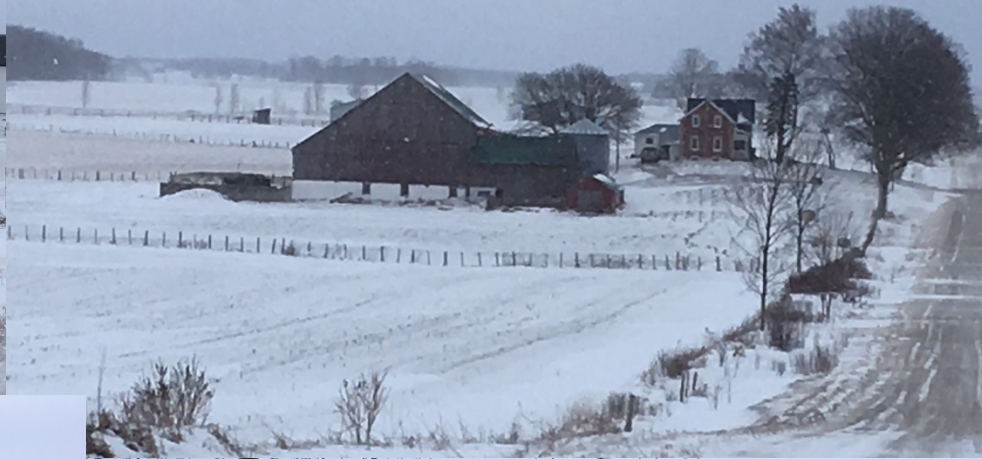
Large Multi-Family Cattle And Crop Farm